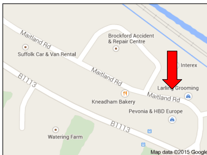
Plan is for identification purposes only

Hubbard House, Civic Drive, Ipswich, Suffolk IP1 2QA