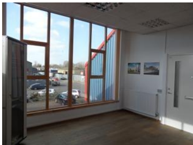
First floor office 2